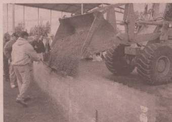
Al Arellanes invented the Rapid Deployment Flood Wall, being filled above.